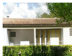
A SHOWER BLOCK