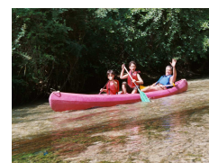
CANOING on the river