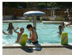
The CHILDRENS at the pool