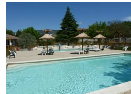
HEATED OUTDOOR POOLS