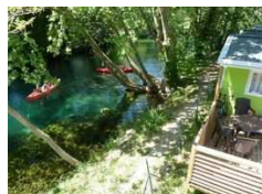
LOGGIA riverside 4 people