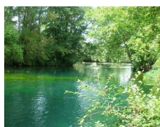
The river SORGUE