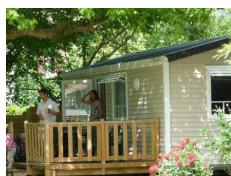
LUBERON cottage 4 people