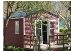
DUO cottage 2/3 people