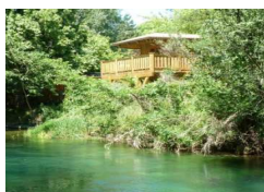
PERCHED LODGE 3/4 people

PATIO riverside cottage , 2 bedrooms and 2 shower rooms 33m 2 ,