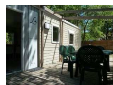
HANDI cottage 4/5 people