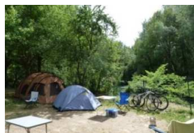
RIVERSIDE COMFORT PITCH